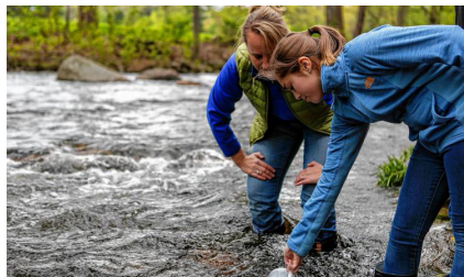
GIRL SCOUTS CAMP LA JITA UTOPIA, TEXAS