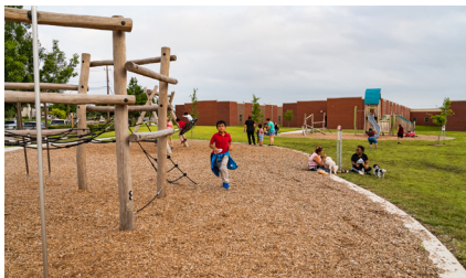
DISD COOL SCHOOLS DALLAS, TEXAS

Girl Scouts Camp La Jita | Utopia, Texas